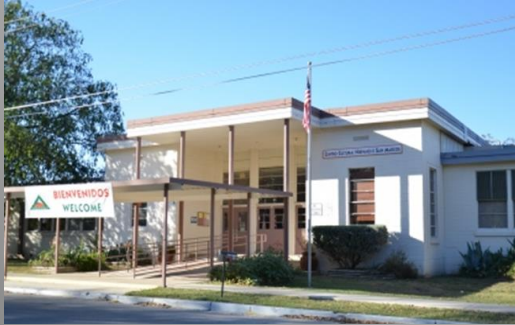
Significance of Place